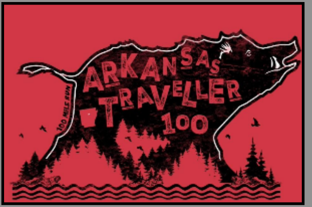
(This Year's Shirt Design)

Our volunteers really are the heart of the Arkansas Traveller 100! I hope you will consider volunteering and serving your community. Sign up soon because we order shirts on September 2nd and the design is Super Cool this year!!!