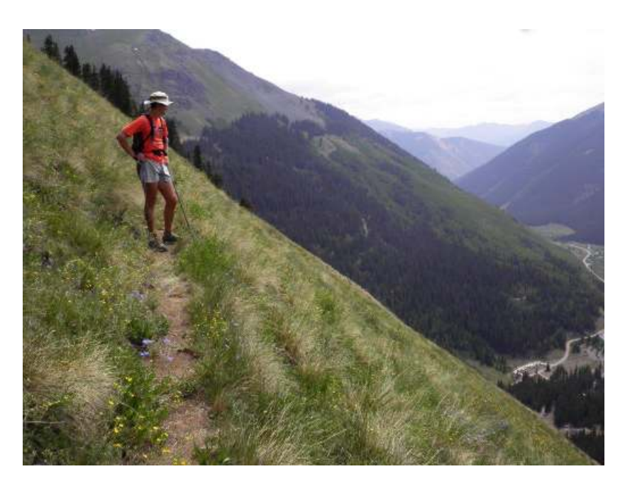
PoDog surveys Kamm Traverse (Hardrock Course)