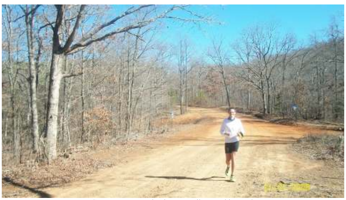
Co-RD PoDog getting in some miles at White Rock