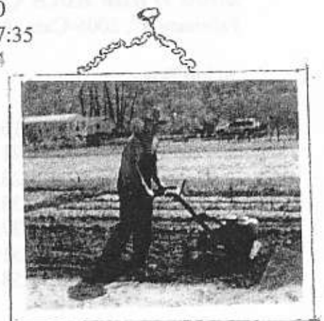
Photo of the BS working as hard as he ever has for you,