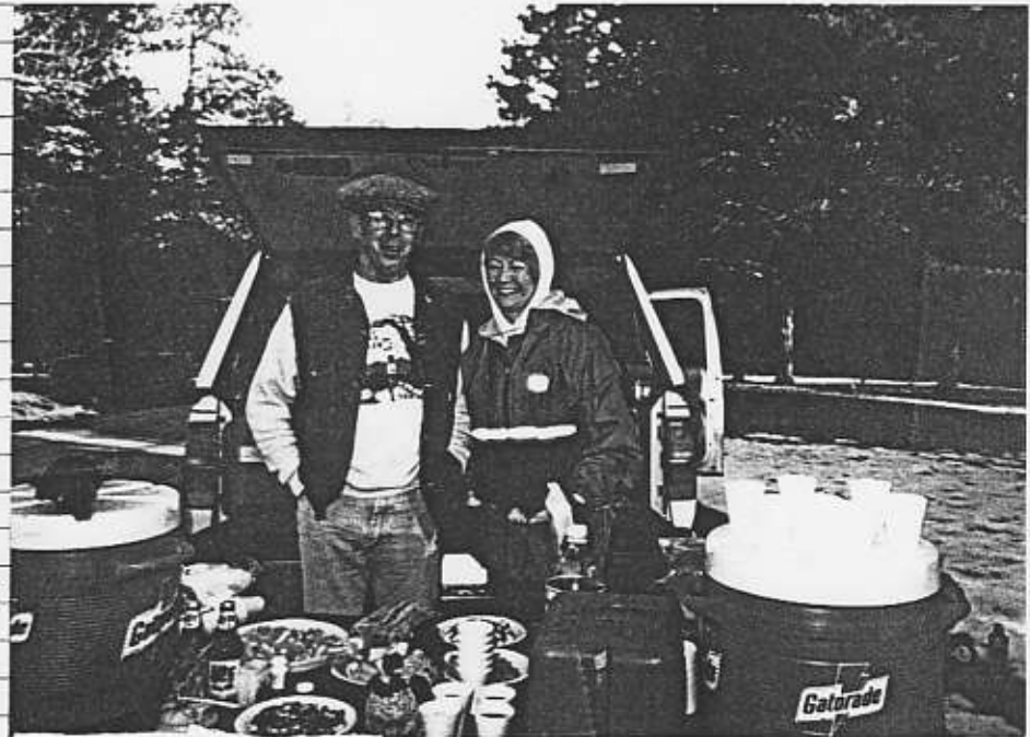
AID STATION WORKERS SYLAMORE 50K