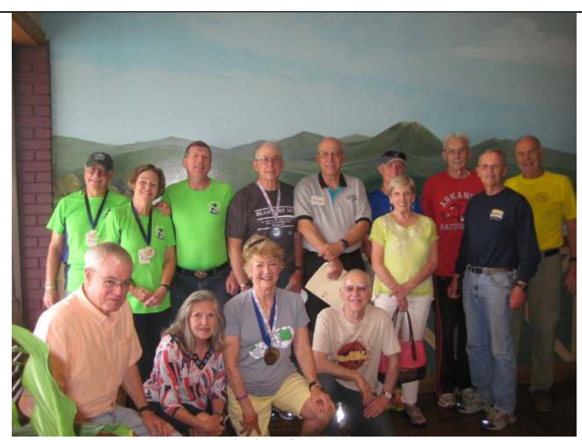
Retreads photo from May 7, 2014

#3 No bike riding is allowed in the park except in the parking lot and drive.