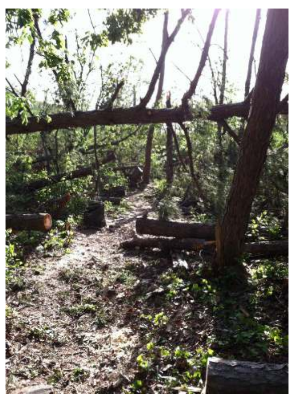
Ouachita Trail damage