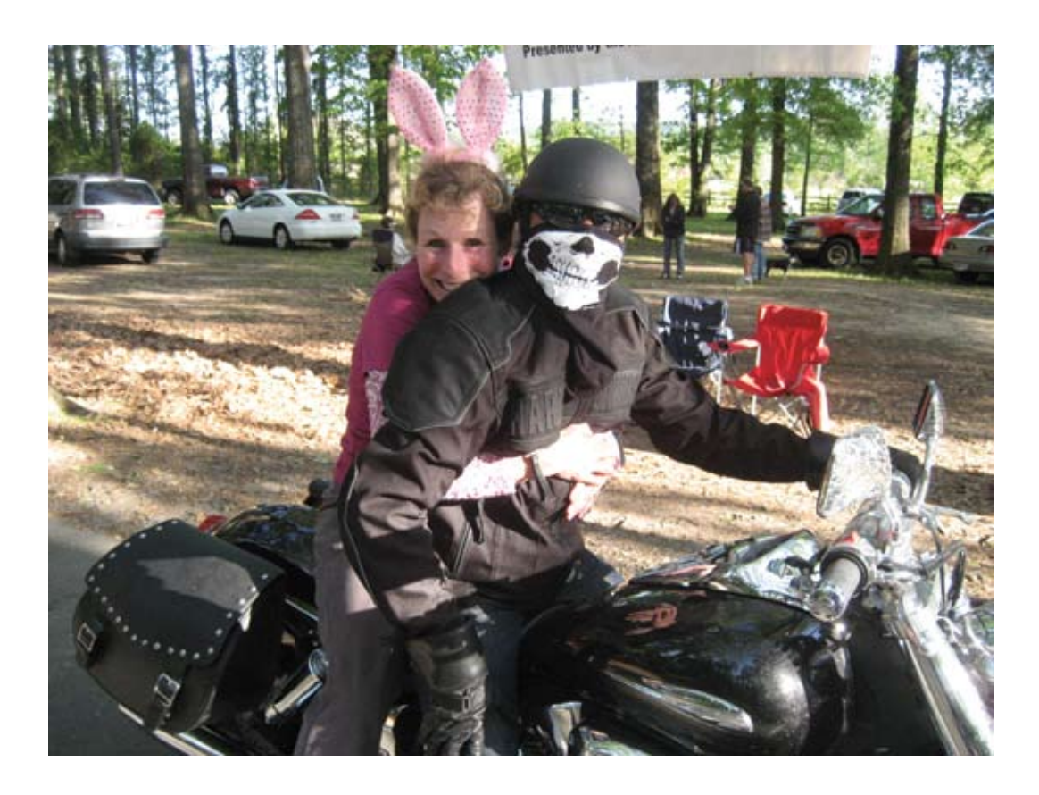
Ouachita Trail Race Director "Gone Bad"