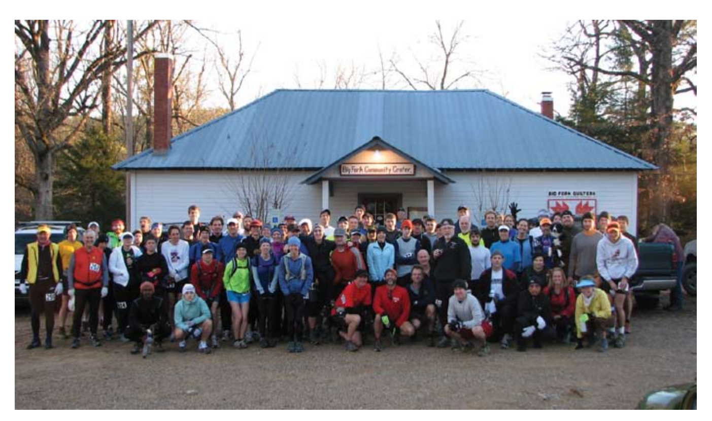
Athens-Big Fork Trail Marathon - Class of 2011