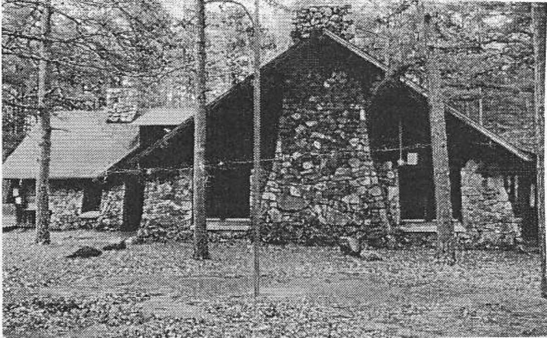
Old photo of Camp Ouachita as it appeared several years before restoration.

I have written this account for those who will follow after me. I know that if I did not write it down it, like other things, will be forgotten and it will be like it never happened.