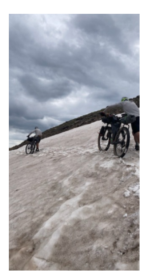
AURA Members Volunteer at Hardrock & Never Summer 100k